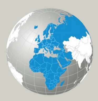
Europe, Middle East & Africa 660 offices and laboratories